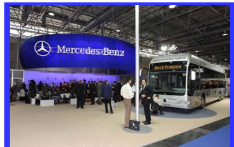
Mobility and City Transport Exhibition is a most chosen venue for World Premieres in public transport sector.

The Exhibition provides a unique opportunity to discover the latest innovations, advanced solutions and recent market developments, with many exhibitors unveiling their latest products on this occasion.