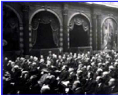
The Brussels Congress in 1922 (left) and the Rome Congress in 2005 (right)

UITP held its very first Congress in Berlin one year after the founding of the organisation in 1885. Berlin led the way to 57 other Congresses up to today, bringing together all public transport actors and mobility experts every two years.