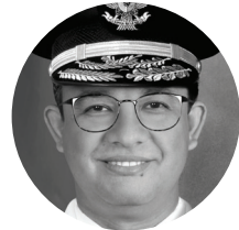
Anies Baswedan Jakarta Governor Chair of the UCLG Community of Practice on Mobility